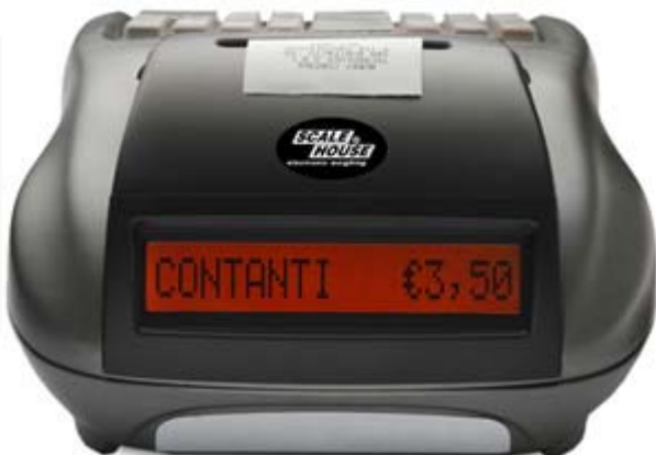
Rear customer view.

Compact, small-sized, easy to use cash register with innovative design. Fitted with backlit large digit display, Multimedia Card for an electronic journal and programmable keyboard functions. Quick and silent integrated thermal printer; fitted with the Easyloading function for quick and easy substitution of the paper.