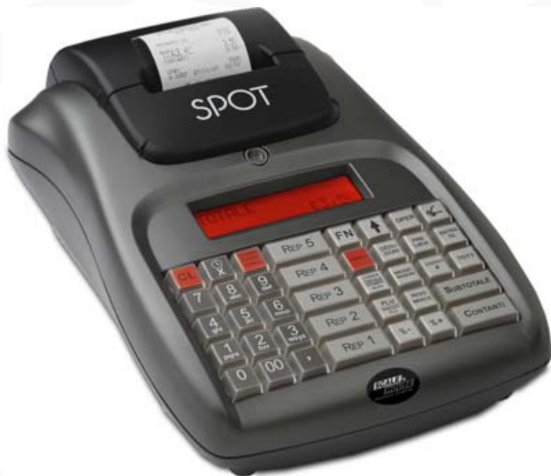
Spot cash register.